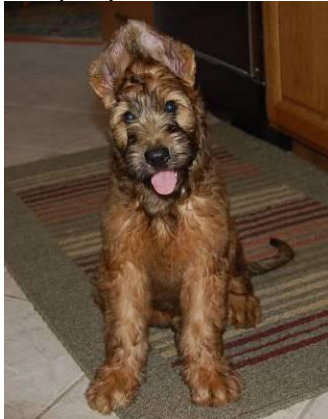
Her name is "Bella" and she is now 11 weeks old, a cousin to Remy. Will keep us really busy for a while!